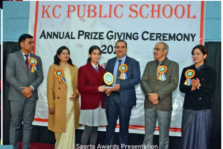
Sports Awards Presentation