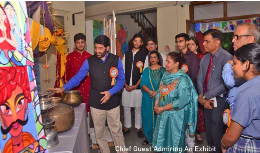
Chief Guest Admiring An Exhibit