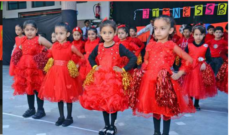
ADORABLE LITTLE ANGELS IN ACTION