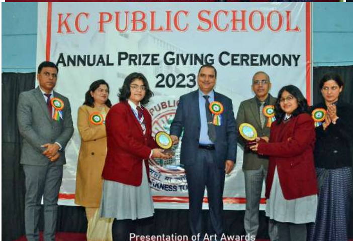
Presentation of Art Awards