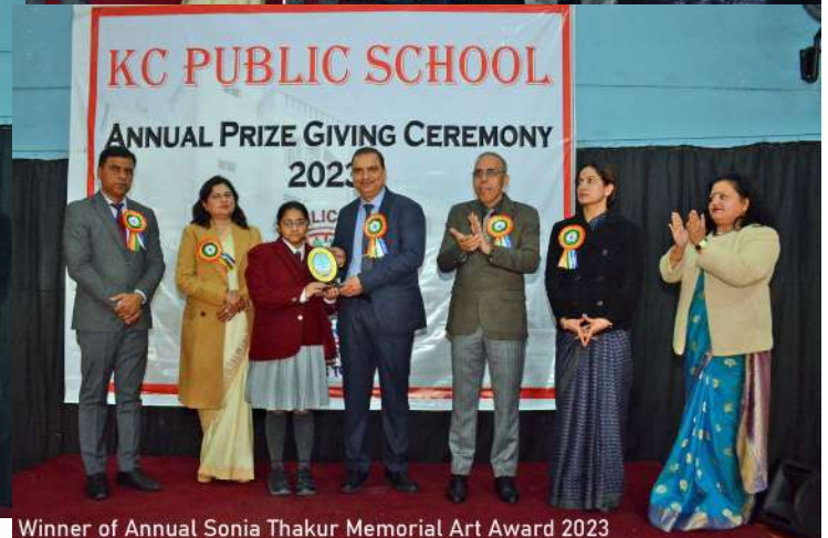
Winner of Annual Sonia Thakur Memorial Art Award 2023