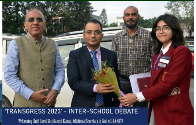
'TRANSGRESS 2023' - INTER-SCHOOL DEBATE