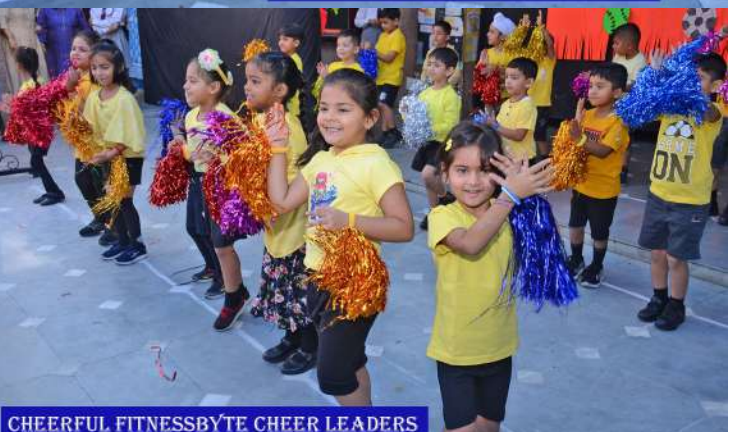
CHEERFUL FITNESSBYTE CHEER LEADERS

As part of the Founder's Day Celebrations this year, we celebrated the Fitnessbyte Festival 23 on Oct 20 in the Junior School Quadrangle. It is an annual event in which our pre-primary kids take part. Here are some pictures of the Festival which suggest how delightful an event it was for both the kids and their young parents.