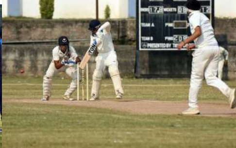
KC SPORTATHON 2023: CRICKET FINAL BETWEEN KCPS & KCIS