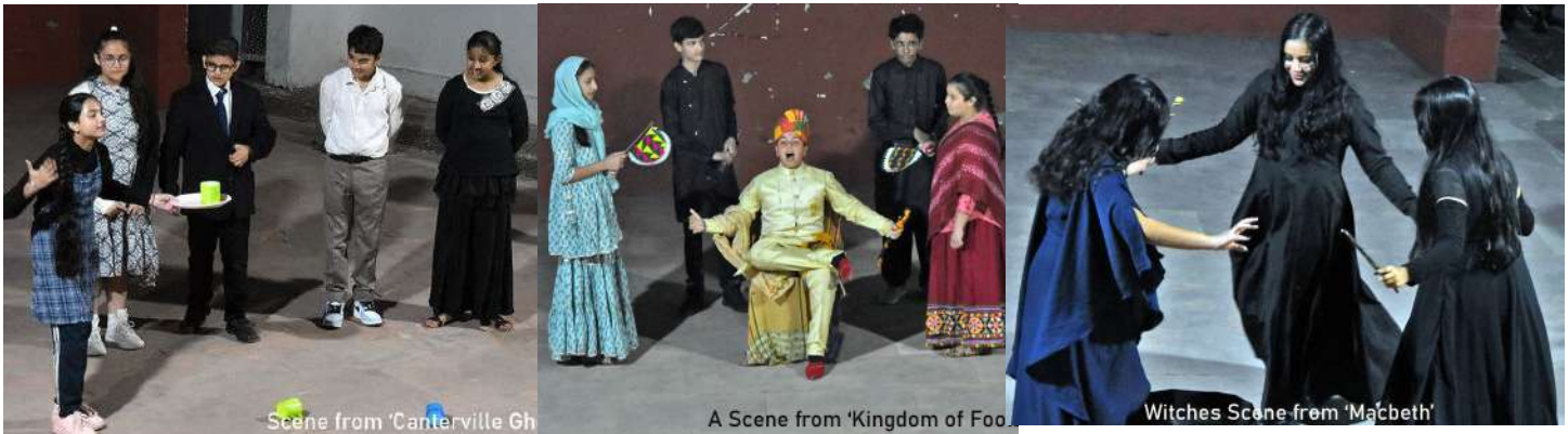
Scene from 'Canterville Gh

Middle School students put up 3 English plays in front of their parents on the evening of Oct 20. All the plays were well performed with good histrionics, costumes and overall presentation.