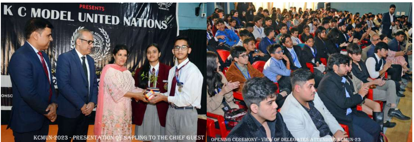
KCMUN-2023 - PRESENTATION OF SAPLING TO THE CHIEF GUEST