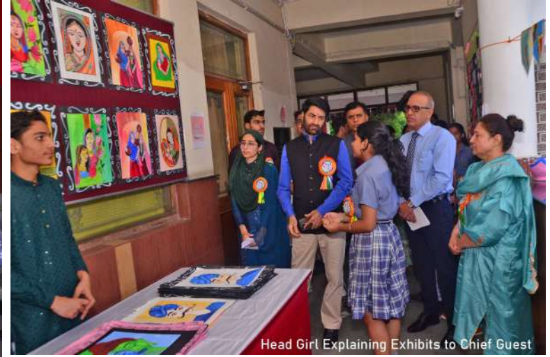
Head Girl Explaining Exhibits to Chief Guest