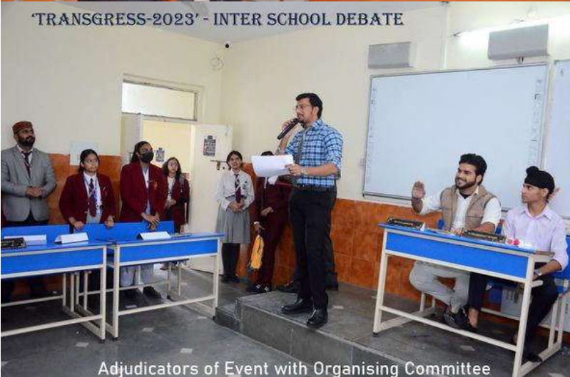
'TRANSGRESS-2023' - INTER SCHOOL DEBATE.

Adjudicators of Event with Organising Committee