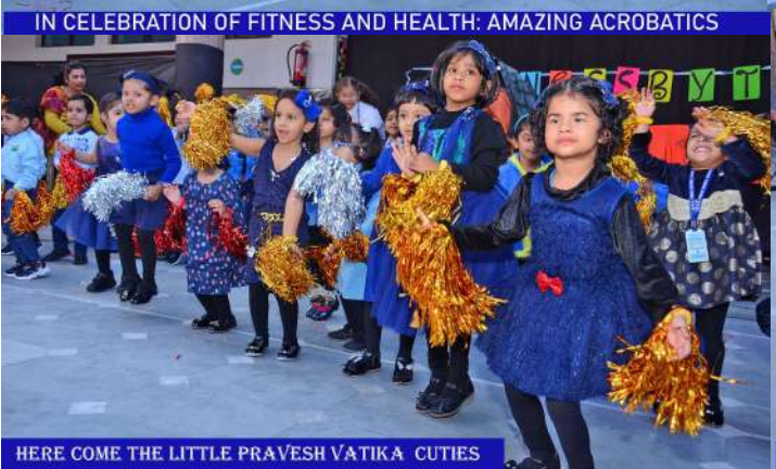
HERE COME THE LITTLE PRAVESH VATIKA CUTIES