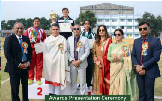
Awards Presentation Ceremony