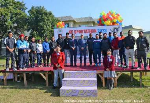
OPENING CEREMONY OF KC SPORTATHON 2023 - NOV 20