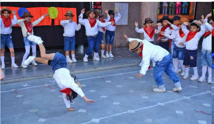
IN CELEBRATION OF FITNESS AND HEALTH: AMAZING AEROBATICS