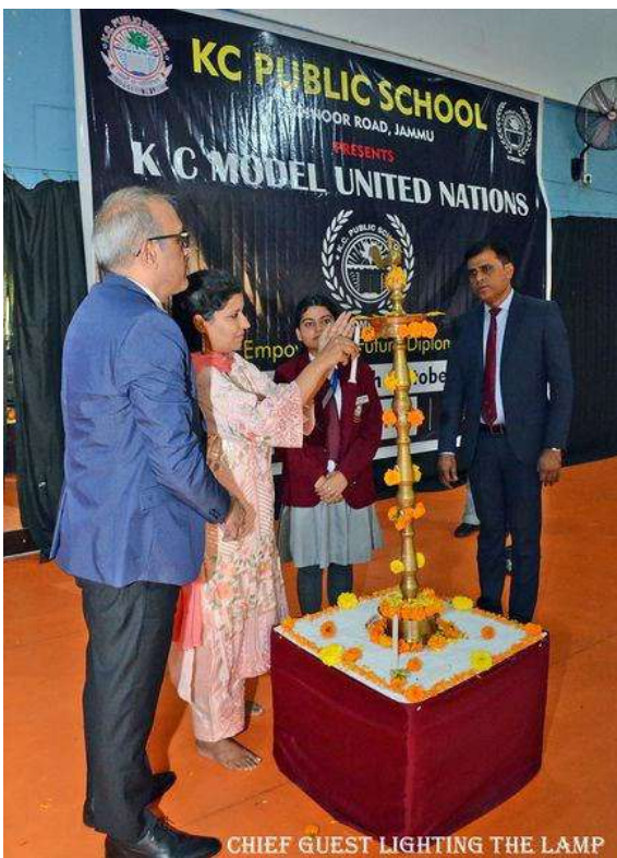
CHIEF GUEST LIGHTING THE LAMP