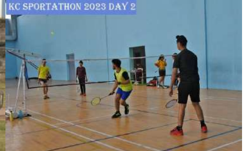
Inter-School Doubles Match in Badminton in Progress