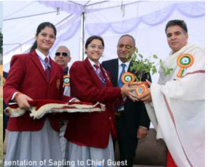
Presentation of Sapling to Chief Guest