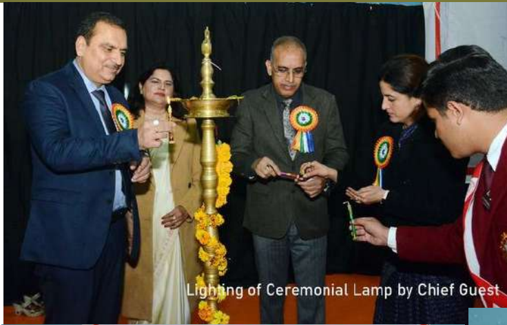
Lighting of Ceremonial Lamp by Chief Guest