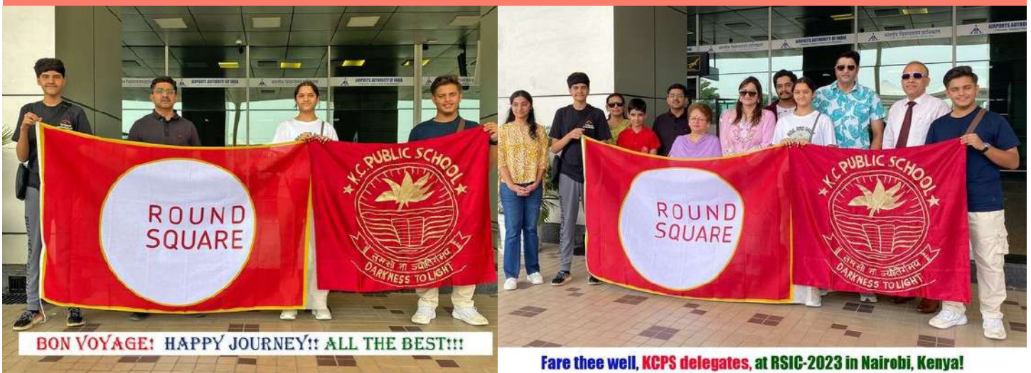
BON VOYAGE! HAPPY JOURNEY!! ALL THE BEST!!!