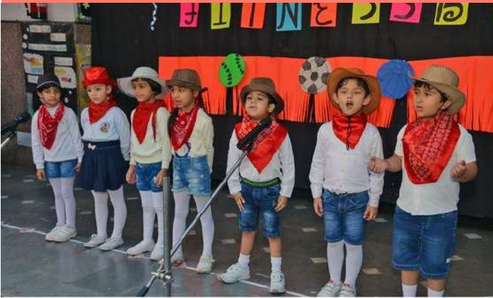
FITNESSBYTE FESTIVAL 2023 : KCPS JUNIOR WING