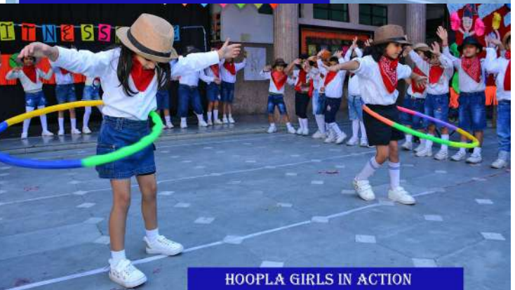
HOOPLA GIRLS IN ACTION