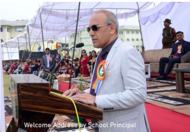
Welcome Address by School Principal