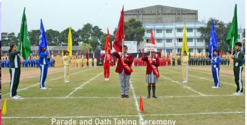
Parade and Oath Taking Ceremony