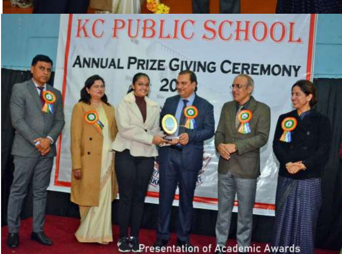
Presentation of Academic Awards