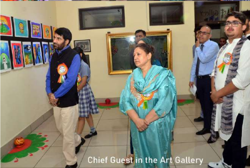
Chief Guest in the Art Gallery

KC Public School organised an art exhibition-cum-sale on 14th October in the school premises. The first of its kind exhibition featured an exciting collection of artworks created by the talented students of the school. The exhibition showcased a diverse range of captivating artworks, including paintings, sculptures, and mixed media installations that reflect the creativity and talent of students. The exhibition served as both an opportunity for students to showcase their artistic abilities and a platform to support and encourage their journey as budding artists. The funds raised from the sale will contribute towards the service programme that the school undertakes and for development of art curriculum, enabling the school to provide better resources and opportunities to its students in the field of art education.