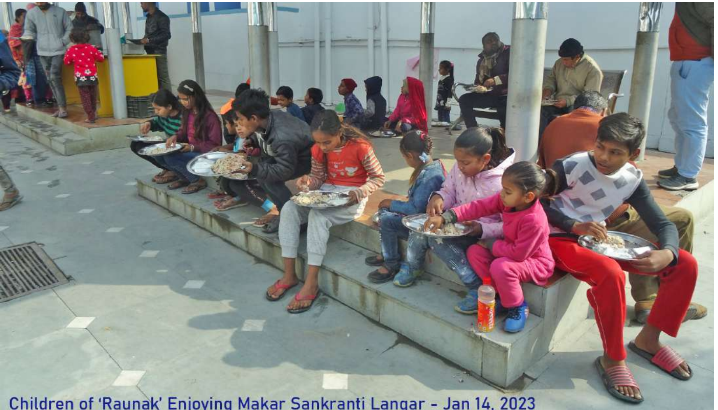
Children of 'Raunak' Enjoying Makar Sankranti Langer - Jan 14, 2023