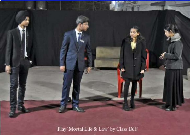
Play 'Mortal Life & Law' by Class IX F