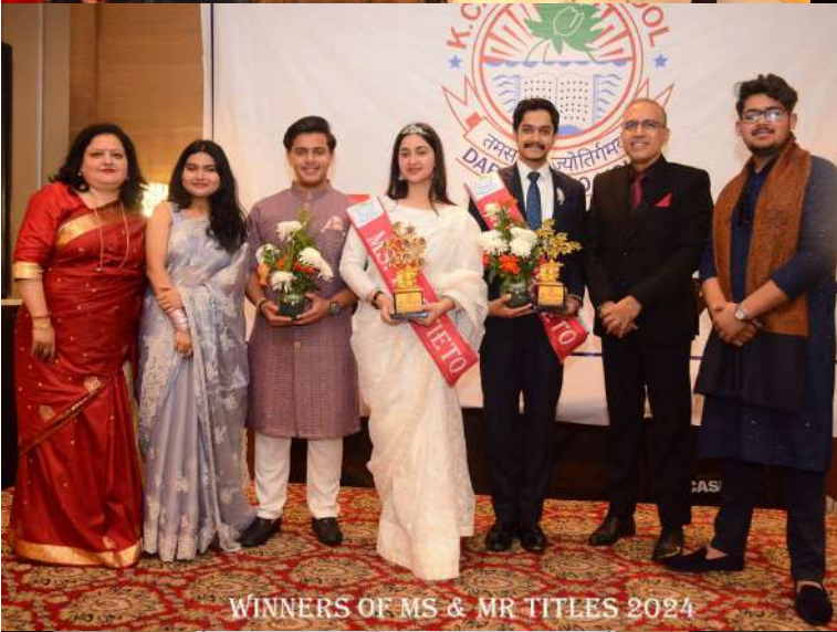
WINNERS OF MS & MR TITLES 2024