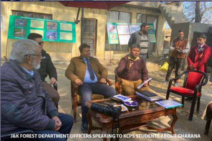
J&K FOREST DEPARTMENT OFFICERS SPEAKING TO KCPS STUDENTS ABOUT GHARANA