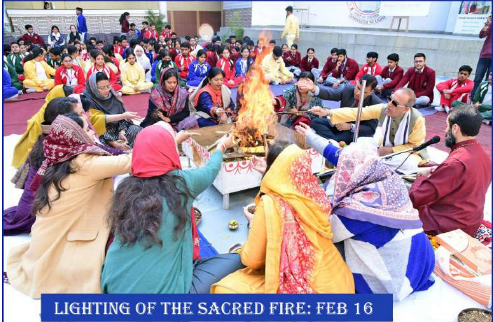
LIGHTING OF THE SACRED FIRE: FEB 16

It is customary at KC Public School to conduct a Havan Ceremony in the senior school quadrangle at this time of the year to offer prayers for the success of Kceans appearing in the CBSE examinations. This year, the ceremony was held on Feb 16 and was attended by students and teachers belonging to diverse faiths, thereby strengthening our faith in and respect for secularism and diversity.