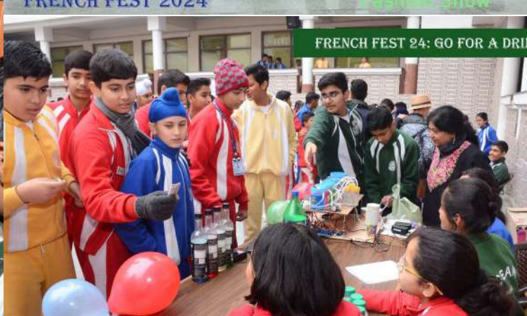
FRENCH FEST 24: GO FOR A DRINK