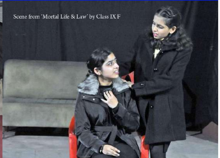
Scene from 'Mortal Life & Law' by Class IX F