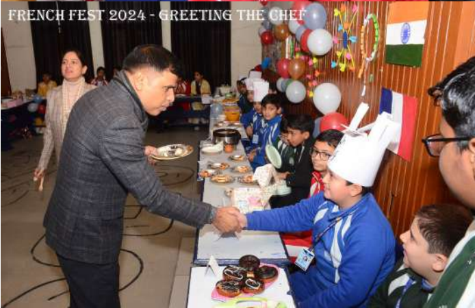
FRENCH FEST 2024 - GREETING THE CHEF