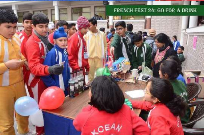
FRENCH FEST 24: GO FOR A DRINK