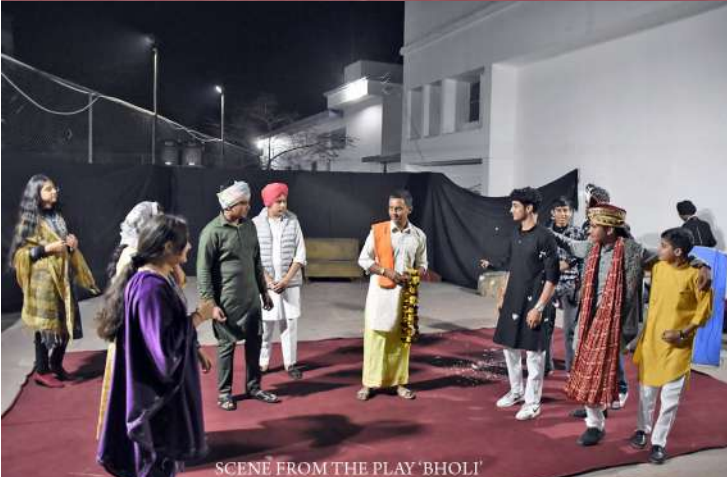
SCENE FROM THE PLAY 'BHOLI'