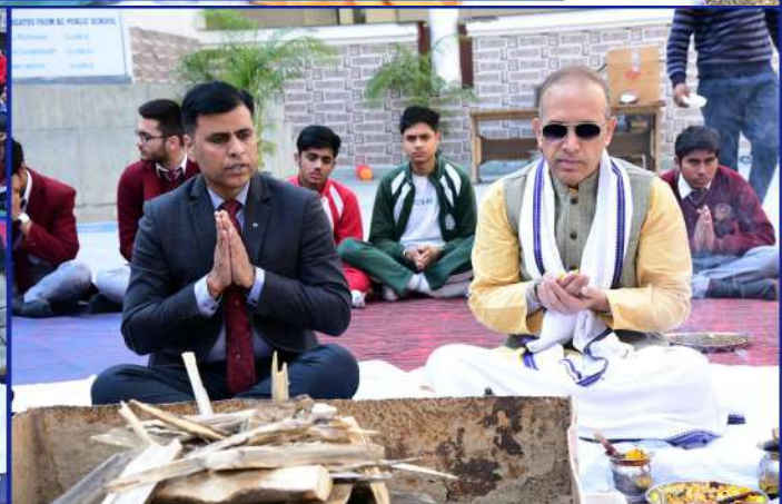
PRINCIPAL & VICE PRINCIPAL AT THE HAVAN CEREMONY 2024