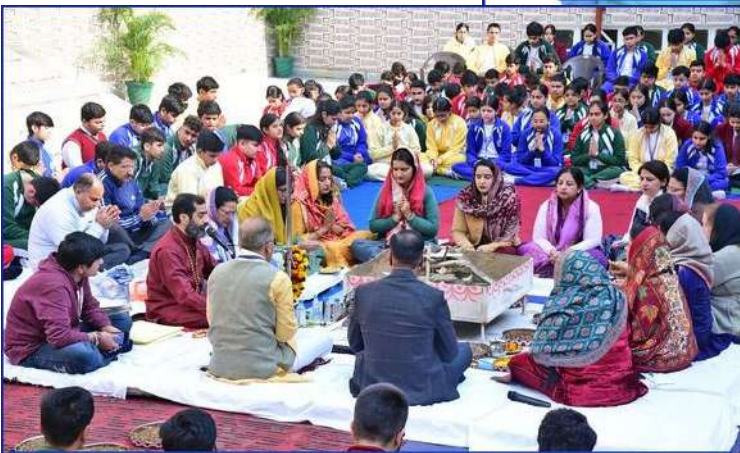
HAVAN CEREMONY IN SR SCHOOL QUAD BEFORE CBSE EXAMS 2024 FOR CLASSES X & XII: FEB 16