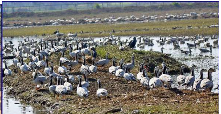
Gharana Bird Sanctuary, RS Pura, Jammu: A Flock of Bar-headed Geese