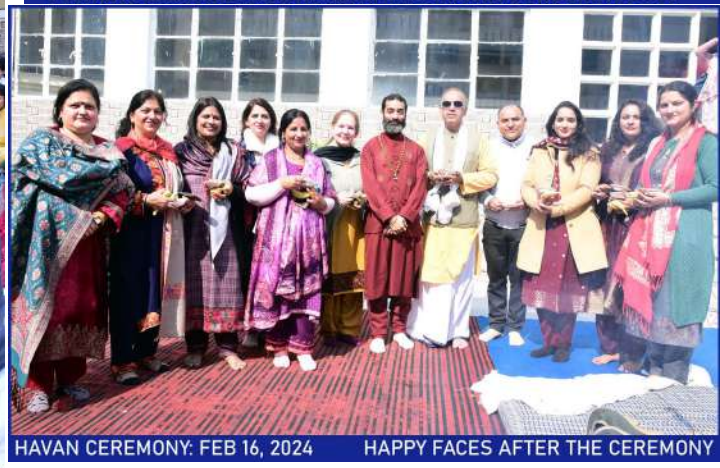
HAVAN CEREMONY: FEB 16, 2024 HAPPY FACES AFTER THE CEREMONY