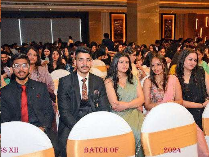
CLASS XII BATCH OF 2024