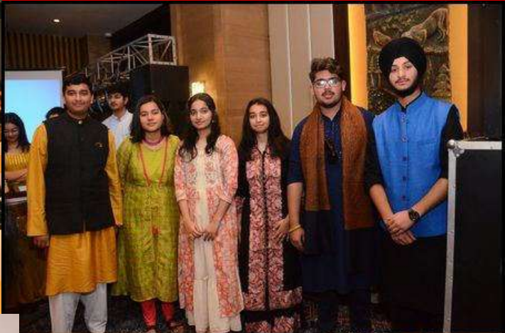
CLASS XI HOSTS