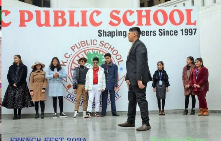
FRENCH FEST 2024