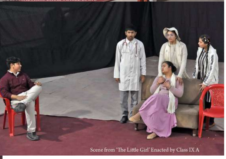
Scene from 'The Little Girl' Enacted by Class IX A