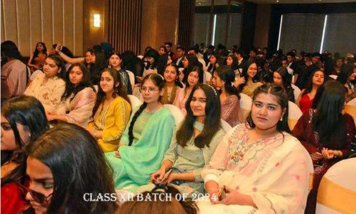
CLASS XII BATCH OF 2024