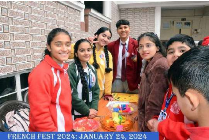
FRENCH FEST 2024: JANUARY 24, 2024

The yearly French Fest 2024 turned out to be a wonderful day for fun and games despite biting cold weather. A real bonanza of delicious French cuisine, hep fashion show on stage, music and dance.