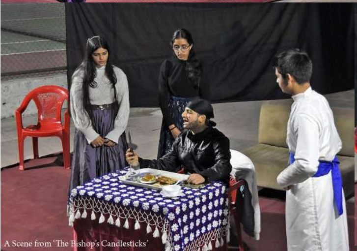
A Scene from 'The Bishop's Candlesticks'