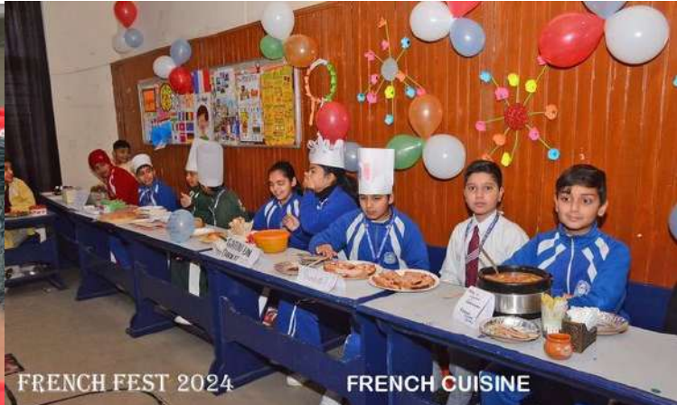
FRENCH FEST 2024