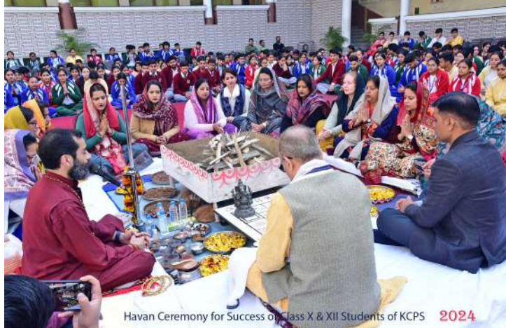
Havan Ceremony for Success of Class X & XII Students of KCPS 2024