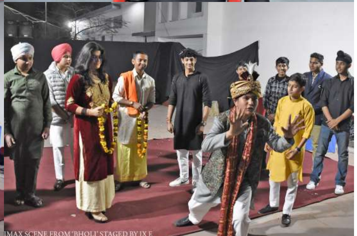
IMAX SCENE FROM 'BHOLI' STAGED BY IX E