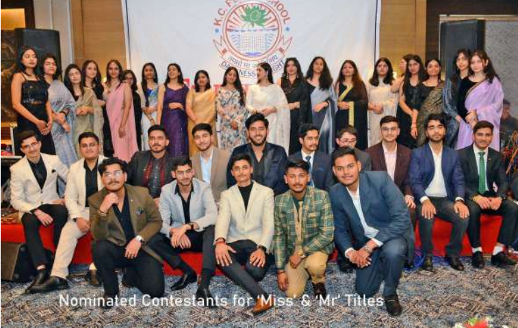
Nominated Contestants for 'Miss' & 'Mr' Titles