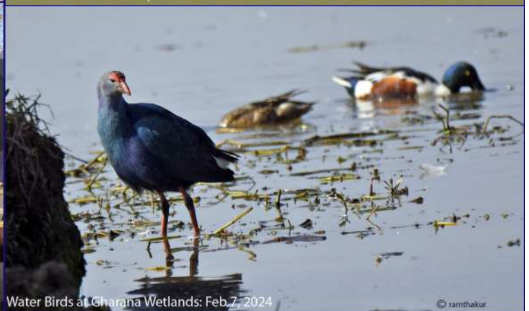
Water Birds at Gharana Wetlands: Feb. 7, 2024

In addition to watching hundreds of migratory birds that visit Gharana during winter months, Kceans also gained an in-depth knowledge about the place by listening to extremely informative talk from some senior officers of the Department of Forests, J&K, who are experts in the conservation of wild life in the Union Territory of Jammu Kashmir.