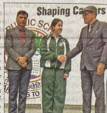
KCPS faculty felicitating winner student.

JAMMU: Eight students of KC Public School took part in an online international debate hosted by Sai International School, Bhubaneswar, Odisha recently. The event witnessed 350 delegates from 41 Round Square schools from all over the world take part in this prestigious event. KC Public School delegation put up an impressive performance in both junior and senior categories