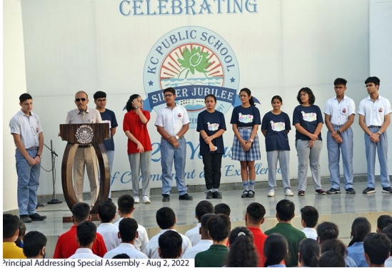
Principal Addressing Special Assembly - Aug 2, 2022