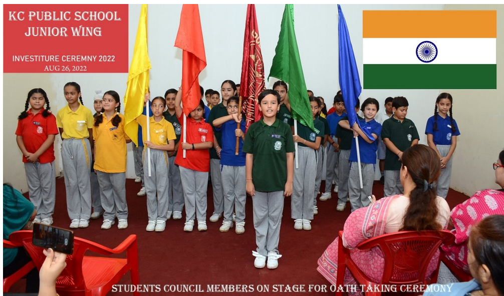
STUDENTS COUNCIL MEMBERS ON STAGE FOR OATH TAKING CEREMONY

The Investiture Ceremony to administer oath of office to the newly elected members of the Students Council was held at Round Square Centre today morning. Parents of stu-