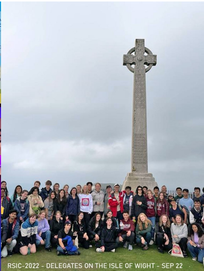
RSIC-2022 - DELEGATES ON THE ISLE OF WIGHT - SEP 22