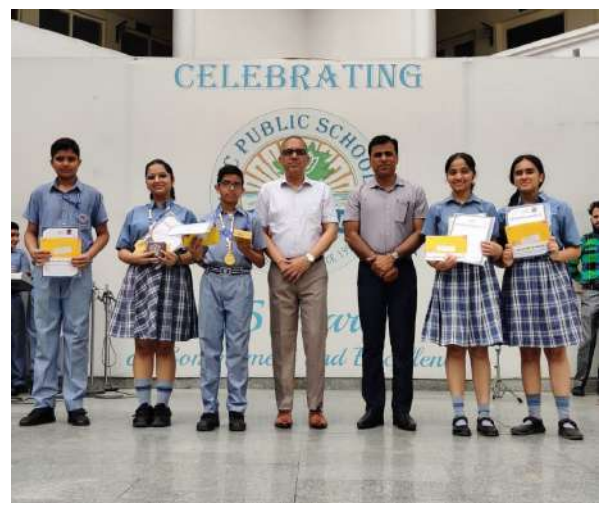
Maintaining its legacy of excelling in SOF competition, Kceans won a number of awards including cash prizes.