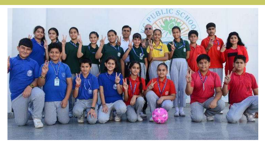
KCPS Shines at Inter-School Netball Tournament

KC Public School proudly announces its exceptional performance in the prestigious Inter -School Netball Tournament organized by the J & K Department of Youth Services and Sports on16th September at Dusshera ground, Gandhi Nagar Jammu . KC Public School's enthusiastic team exhibited exceptional teamwork, grit, and determination, securing a remarkable position in the tournament.