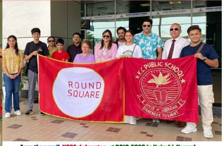
Fare thee well, KCPS delegates, at RSIC-2023 in Nairobi, Kenya!