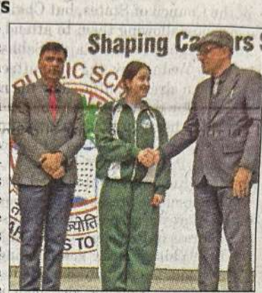
KCPS faculty felicitating winner student.

STATE TIMES NEWS JAMMU: Eight students of KC Public School took part in an online international debate hosted by Sai International School, Bhubaneswar, Odisha recently. The event witnessed 350 delegates from 41 Round Square schools from all over the world take part in this prestigious event. KC Public School delegation put up an impressive performance in both junior and senior categories