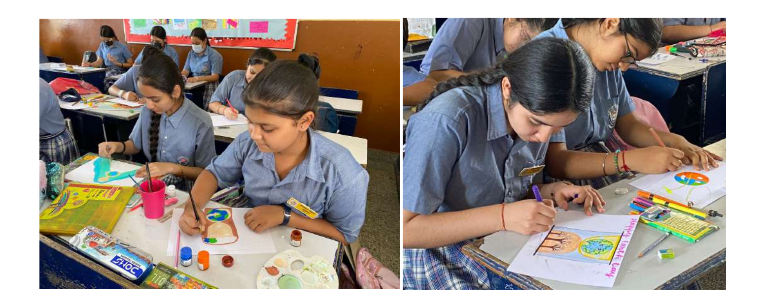
Theme: I Love Mother Earth

Here are some pictures of students creating paintings on the theme: I LOVE MOTHER EARTH.