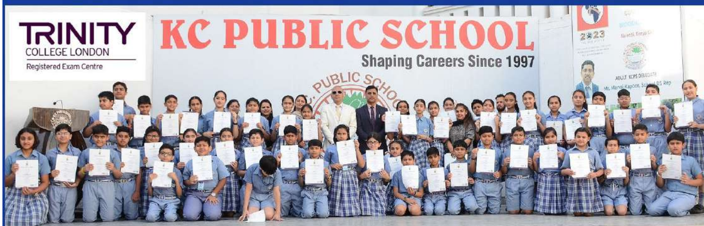
Recipients of Certificates for Communication Skills in English